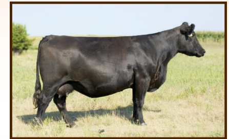
LC Barbarae X698 Dam of Lot 28