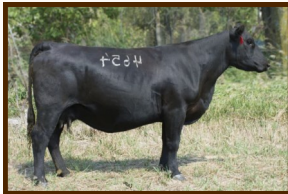
LNCTS Lady Lass 4654 Dam of Lot 6