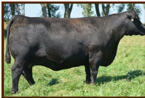
EF Hazel 1261 Donor Dam of Lots 26 & 27