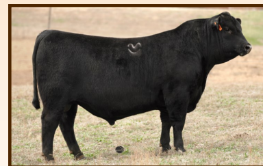
B/R Nationwide 69