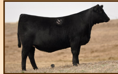
B/R Pride 618