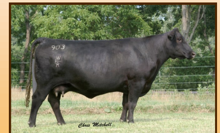
WTR Miss Traveler 903 Matriarch Lot 9 & 24