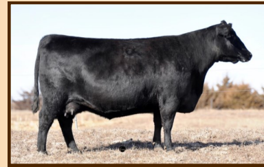
B/R Pride 1551 Dam of Lot 5

For over a decade we have consistently been in the top tier at both bull tests! These proven "Bull Maker Moms" provide you the confidence to buy Lienetics Ranch and Willer Timber Ridge bulls to advance your program.