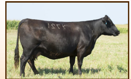
LC Lucinda 9721 Dam of Lot 13