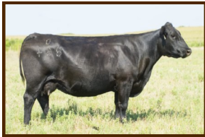
LC Kildonia X864 Dam of Lot 138 At Midland Bull Test