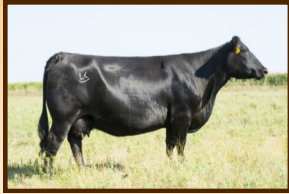
LC Lady Lass 8384 Dam of Lot 1

Proven by entering sons in the most demanding bull tests in the country.