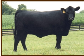
WTR 6163-3058 Primrose 011 Third Dam of Lot 10