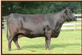
WTR LT-208 Rosetta 409 Third Dam of Lot 35